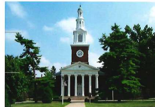
University of Kentucky