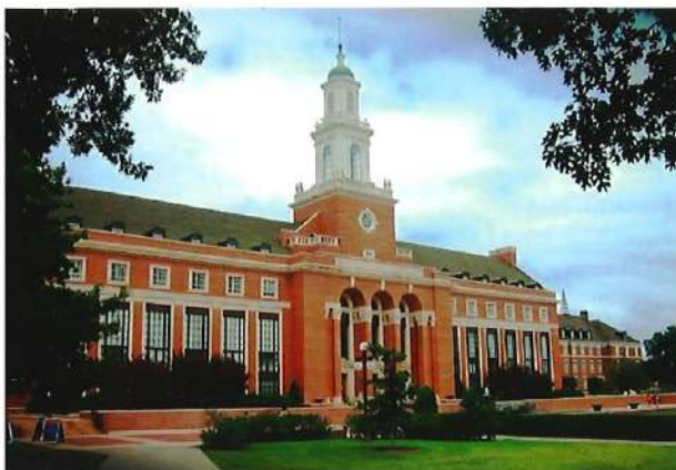
Oklahoma State University