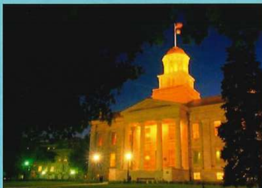
University of Iowa

Historically, about one-third of eligible applicants are awarded scholarships.