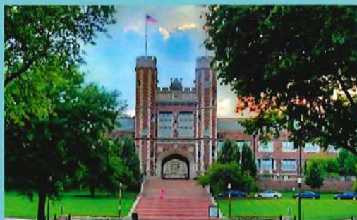
Washington University in St. Louis