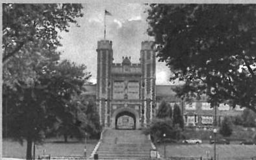
Washington University in St. Louis