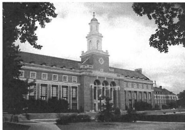
Oklahoma State University