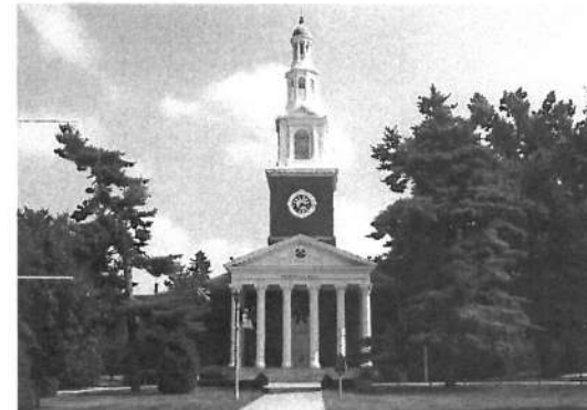
University of Kentucky