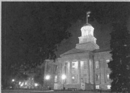
University of Iowa

Historically, about 40% of eligible applicants are awarded scholarships. The highest award percentage by far of any national scholarship.