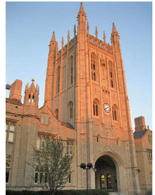
University of Missouri-Columbia

Each scholarship is worth up to $40,000 over four years. The average four year disbursed amount is over $24,000. Three hundred forty five Hagan Scholars currently attend one hundred thirty four colleges and universities.