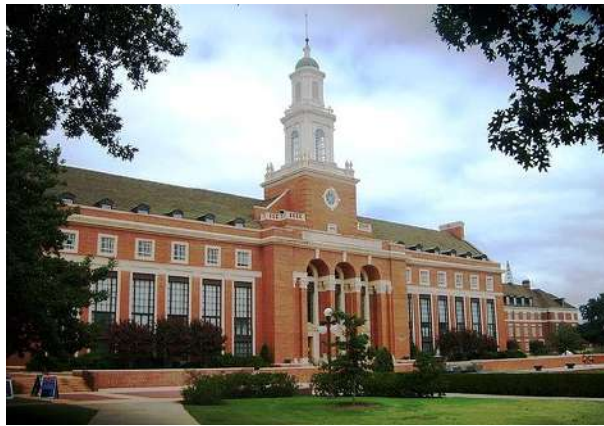
Oklahoma State University