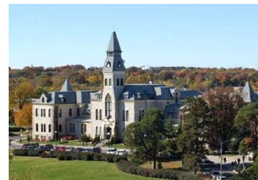
Kansas State University

8. Recipients must work a minimum of 240 hours in the twelve months prior to the start of college.