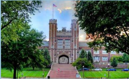
Washington University in St. Louis