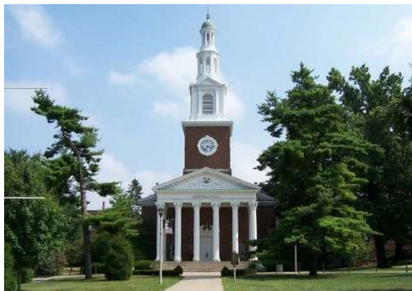
University of Kentucky