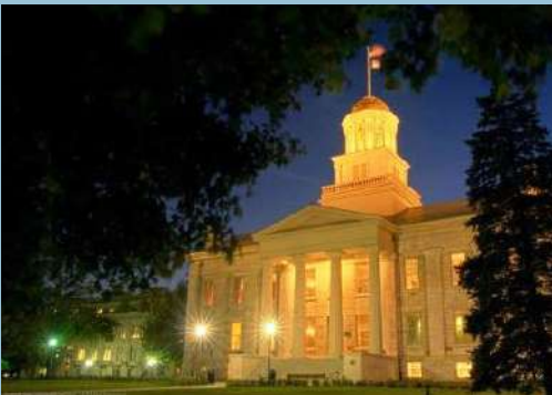
University of Iowa

Over the past three years, one-third of eligible applicants were awarded Hagan Scholarships. Each finalist interviewed and not awarded a scholarship received $1,000.