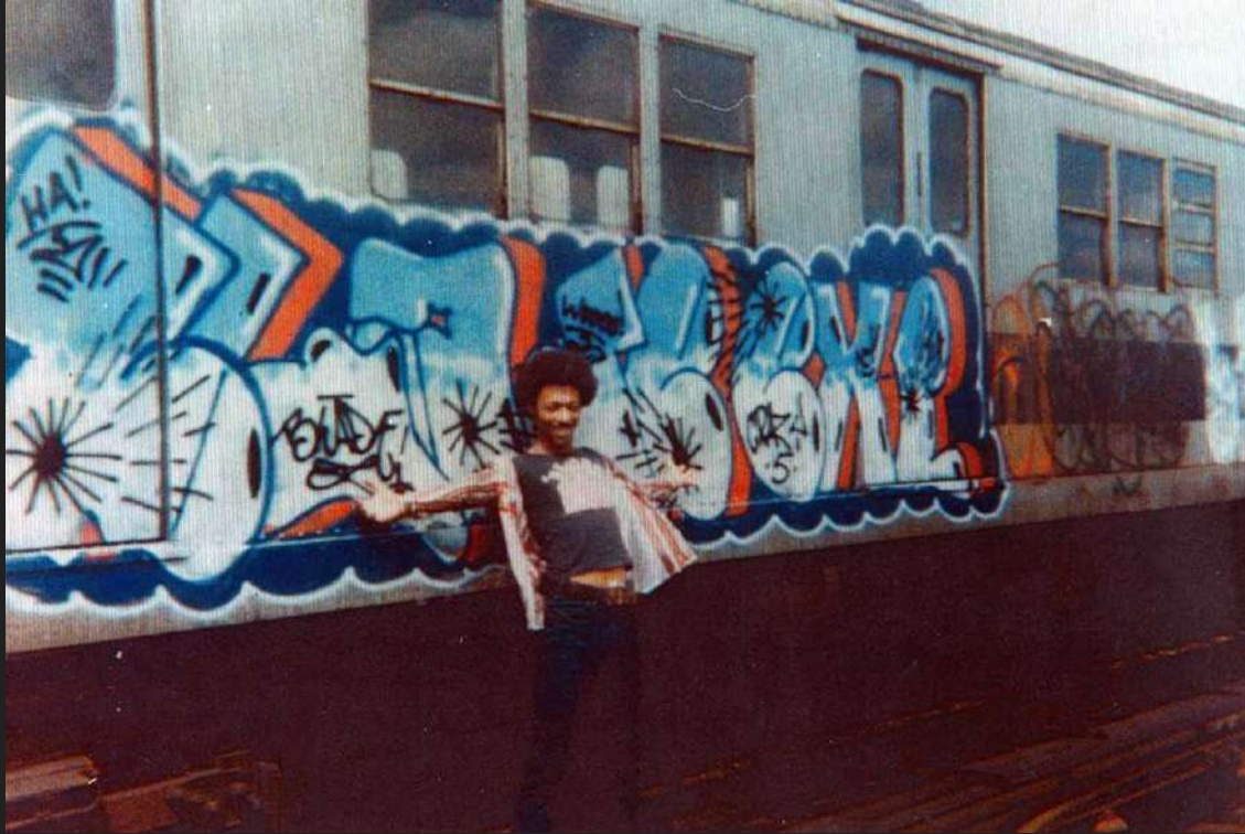
Portrait of Phase 2 with his artwork

The early 1970's saw the emergence of two legends of the graffiti scene- Phase 2, who developed his distinctive bubble writing and Blade, who became known for covering entire train carriages with graffiti work.