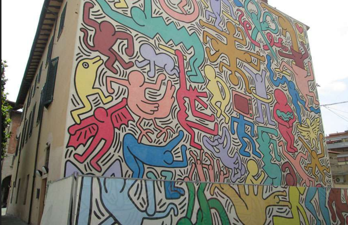
Mural by the artist Keith Haring