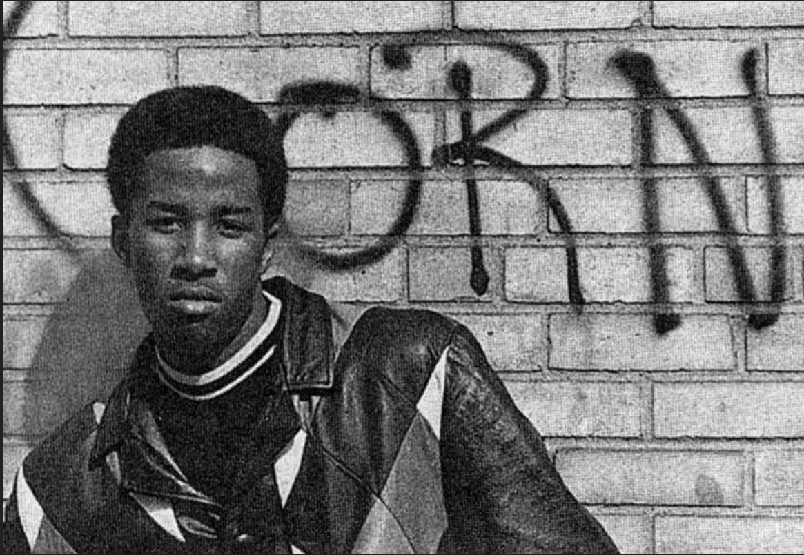
Portrait of Darryl McCray with his tag