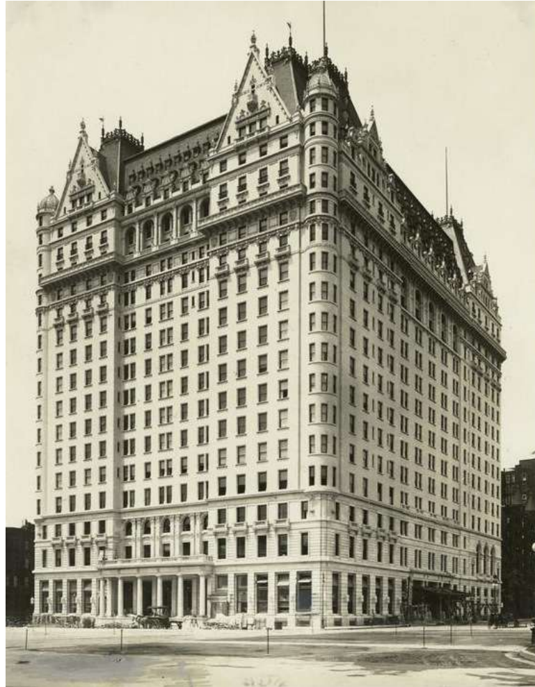
The Gilded Age