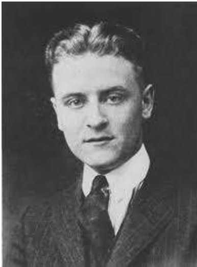
F. Scott Fitzgerald