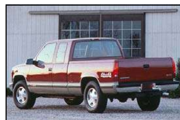
$9,900 2002 GMC Sierra