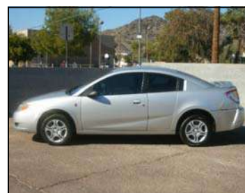
$3,995 2004 Saturn ION