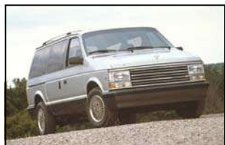
$900 1990 Plymouth Grand Voyager