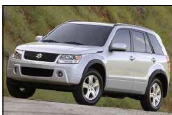
$9,467 2006 Suzuki Grand Vitara