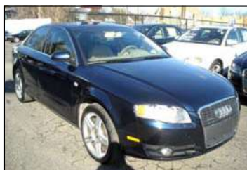
$23,760 2007 Audi A4