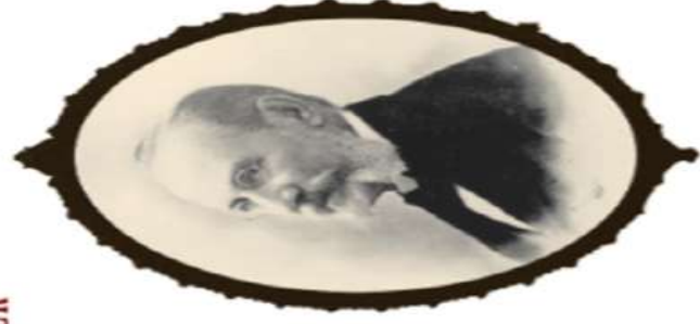
Carlos Finlay (1833–1915)