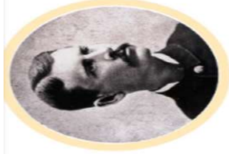
Walter Reed (1851–1902)