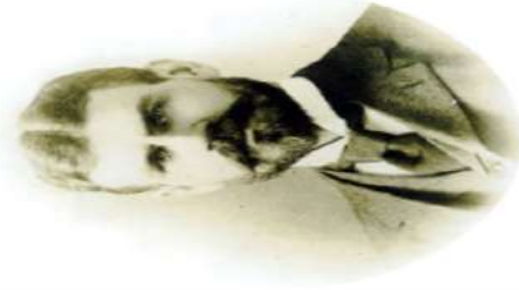
Jesse Lazear (1869–1900)