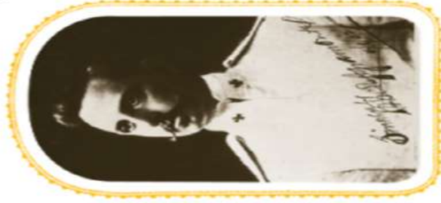
Aristides Agramonte (1869–1931)