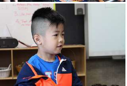
Pre-Kindergarten students during their first week of school at Stevenson Elementary.