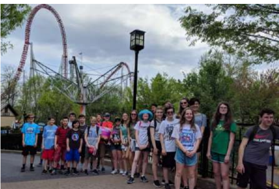
Over 25 students from The Math Club attended Math Day at Hershey Park in May.

Students collected data at the various math labs around the park to sharpen their math skills and expand their knowledge of different rides.