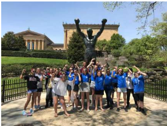
The Creative Writing Club and MOCA Literary Magazine visited the Philadelphia Museum of Art in May.