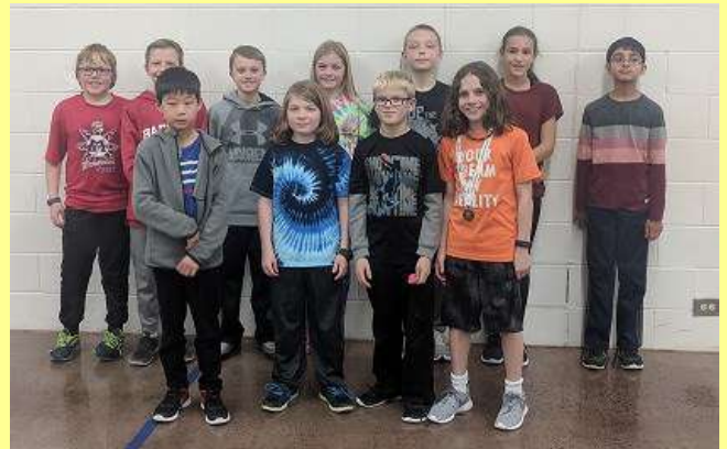
SAGE Geography Bee Finalists: (left to right)