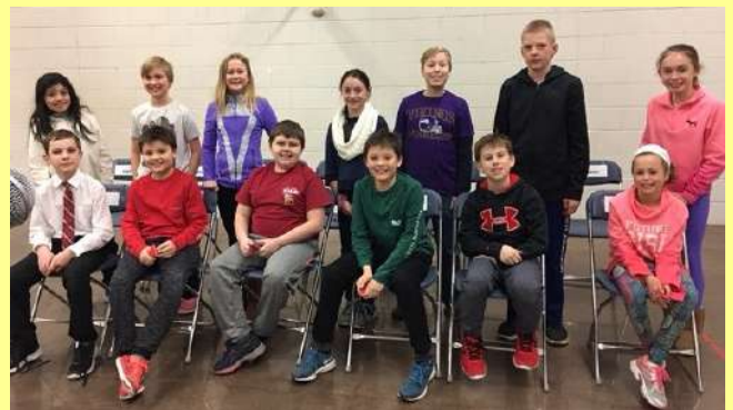
WestWood Geography Bee Finalists: (left to right)