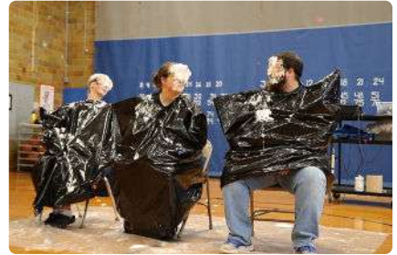
Teachers Get Pied!!!