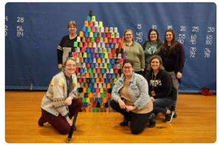
Cup Stacking Competition Fun!