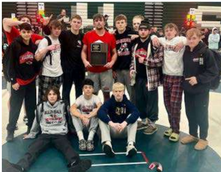
All the girl wrestlers medaled at the West Olive Invite