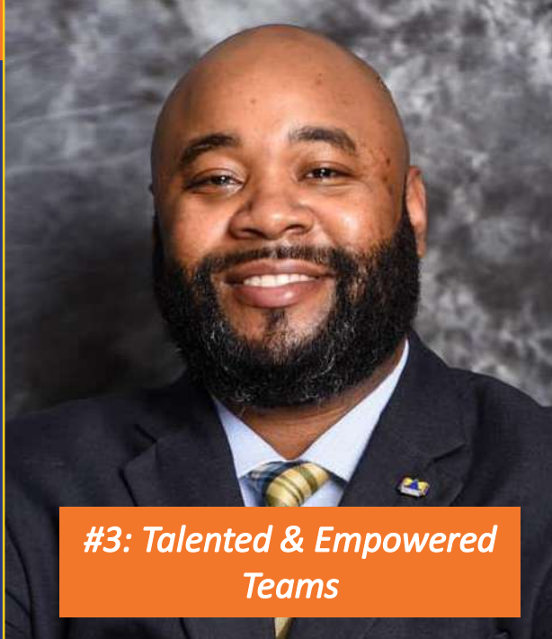
#3: Talented & Empowered Teams