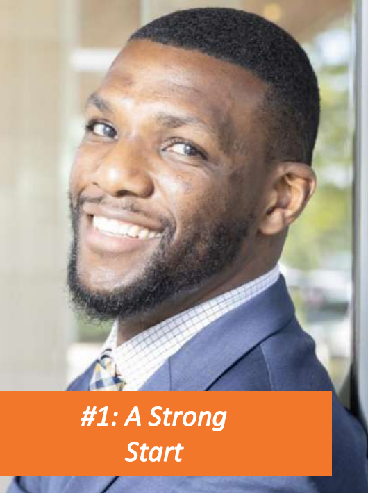
#1: A Strong Start