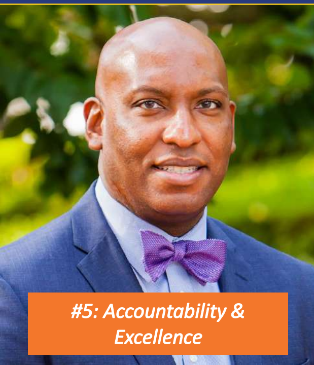
#5: Accountability & Excellence