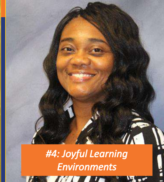
#4: Joyful Learning Environments