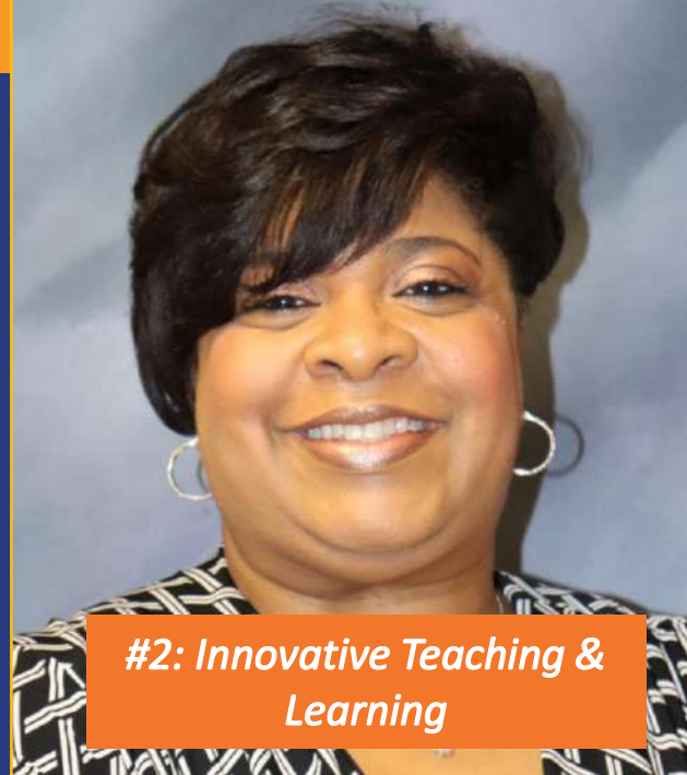
#2: Innovative Teaching & Learning