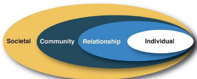
The Social-Ecological Model

Adapted from "The social ecological model," by Washington Coalition of Sexual Assault Programs (WCSAP), 2019, Olympia, WA. Copyright 2019 by WCSAP. Reprinted with permission.