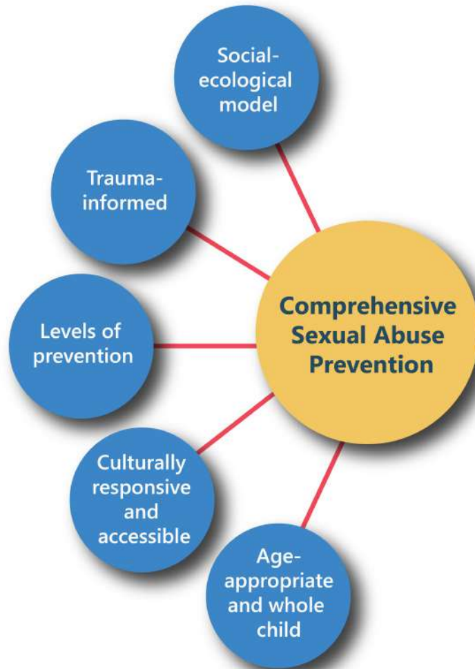
Aspects of Comprehensive Sexual Abuse Prevention