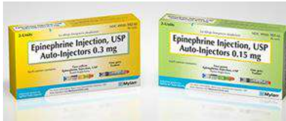
Generic Epinephrine USP auto-injector