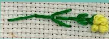
Fly Back French Knot