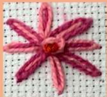
Tri-Color Lazy Daisy with French Knot