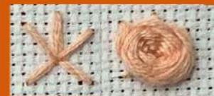
Woven Spider or Woven Wheel