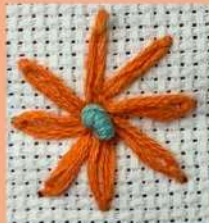
Lazy Daisy with French Knot