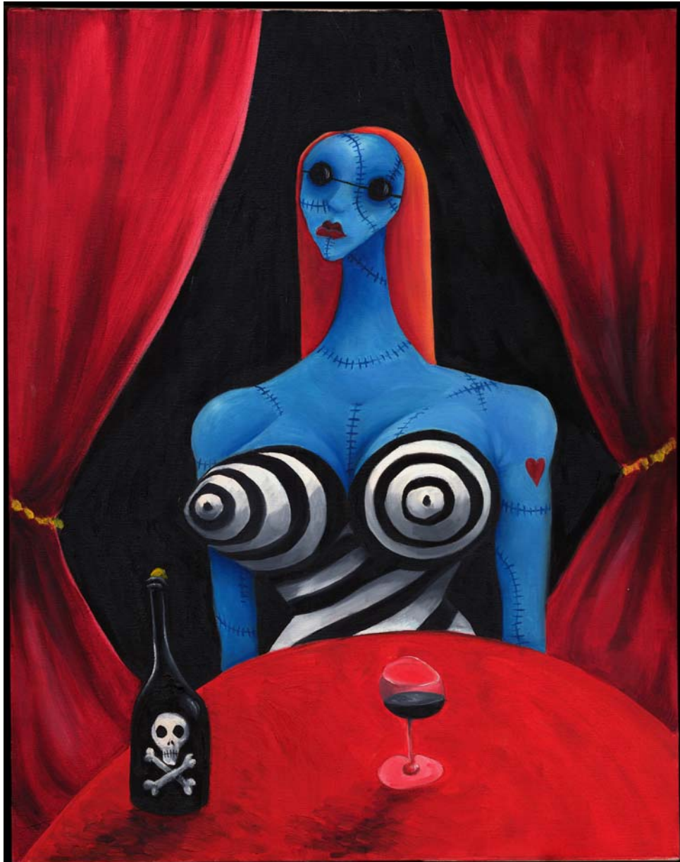
TIM BURTON (American, born 1958) Blue Girl with Wine , c. 1997 Oil on canvas 71.1 x 55.9 cm Private Collection © 2010 Tim Burton