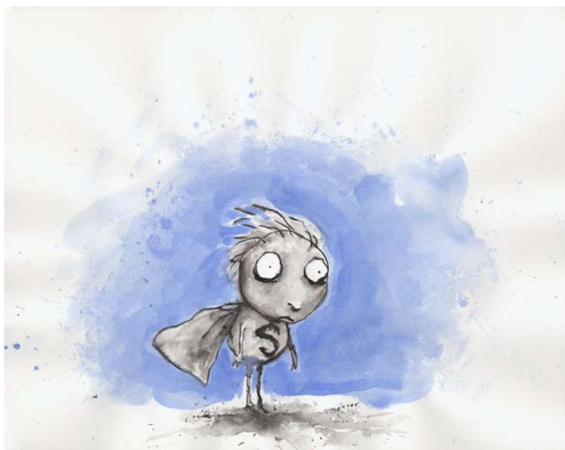
Tim Burton (American, b. 1958) Untitled ( The Melancholy Death of Oyster Boy and Other Stories ) 1998 Pen, ink and watercolour on paper 11 x 14" (27.9 x 35.6 cm) Private collection © 2010 Tim Burton

Tim Burton's characters and narratives often represent the 'outsider', the misunderstood, the lonely, and the rejected. Burton explores themes of the individual feeling outside yet looking in so wonderfully, Burton expresses pathos and understanding of his 'outsiders' these beautifully conceived characters and he respectfully cherishes them.