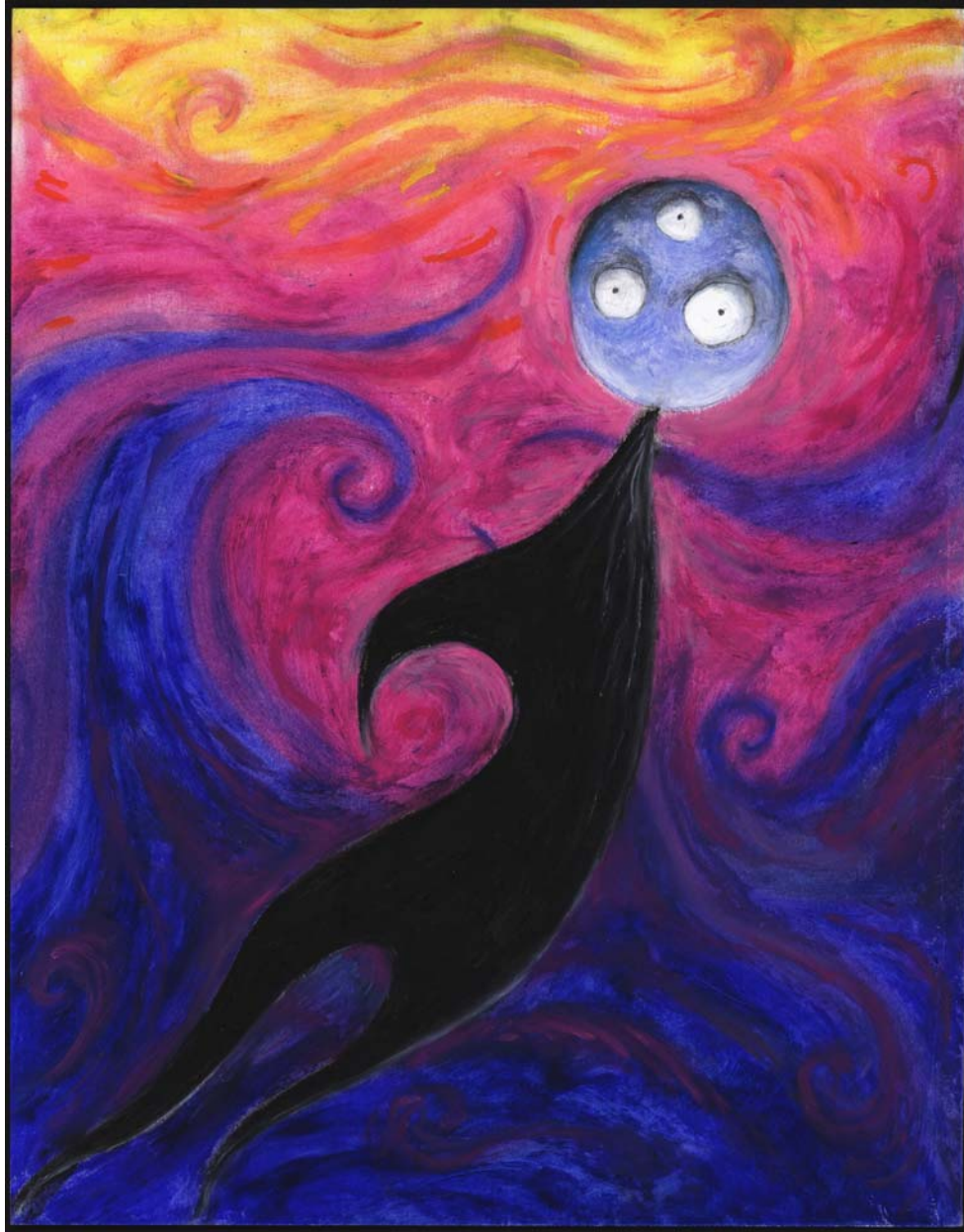
TIM BURTON (American, born 1958) Untitled (Creature Series), 1997-1998 Pastel on paper 35.6 x 27.9 cm Private Collection © 2010 Tim Burton