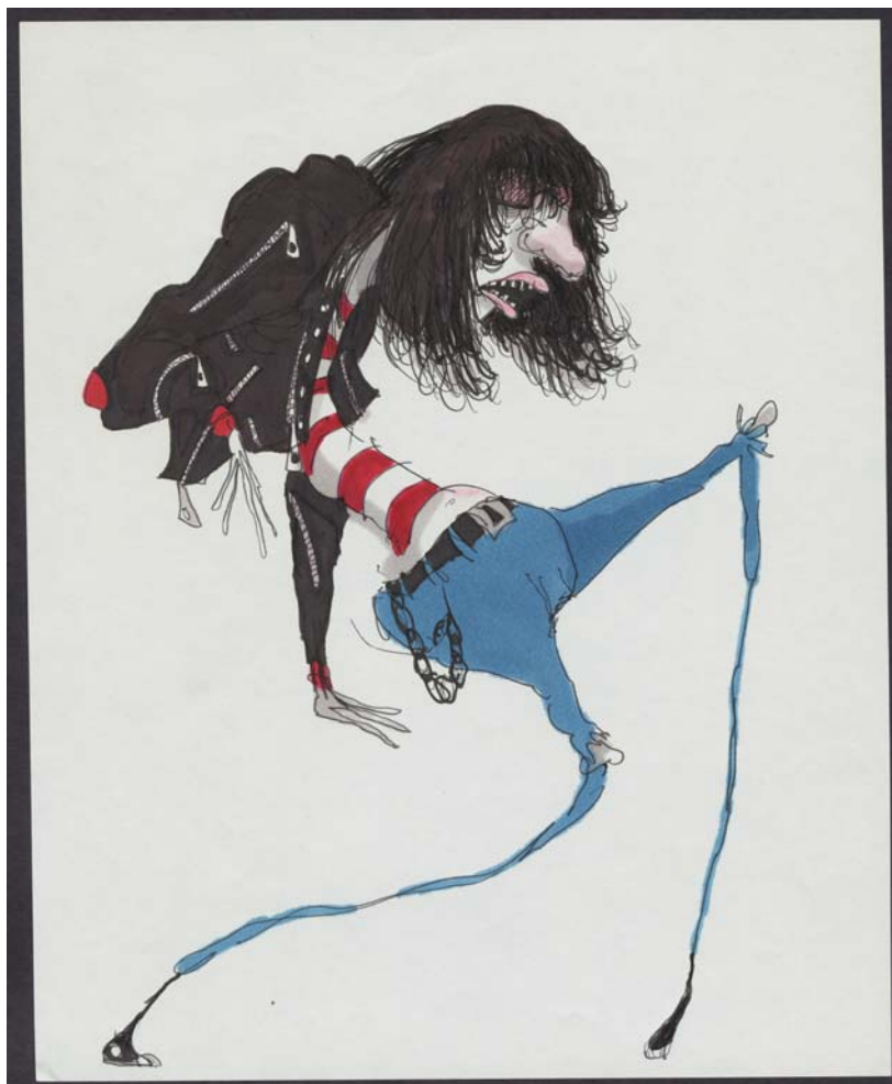
Tim Burton (American, b. 1958) Untitled (Ramone) 1980-1990 Pen, ink, marker, and coloured pencil on paper 11 x 9" (27.9 x 22.9 cm) Private collection © 2010 Tim Burton

Timothy Walter Burton was born August 25 in 1955. He grew up in Burbank, California, near Hollywood. From a young age, Burton was mesmerized by popular culture and loved Sci-Fi and Horror films, the extraordinary horror-genre actor the late, Vincent Price being a particular influence and inspiration.