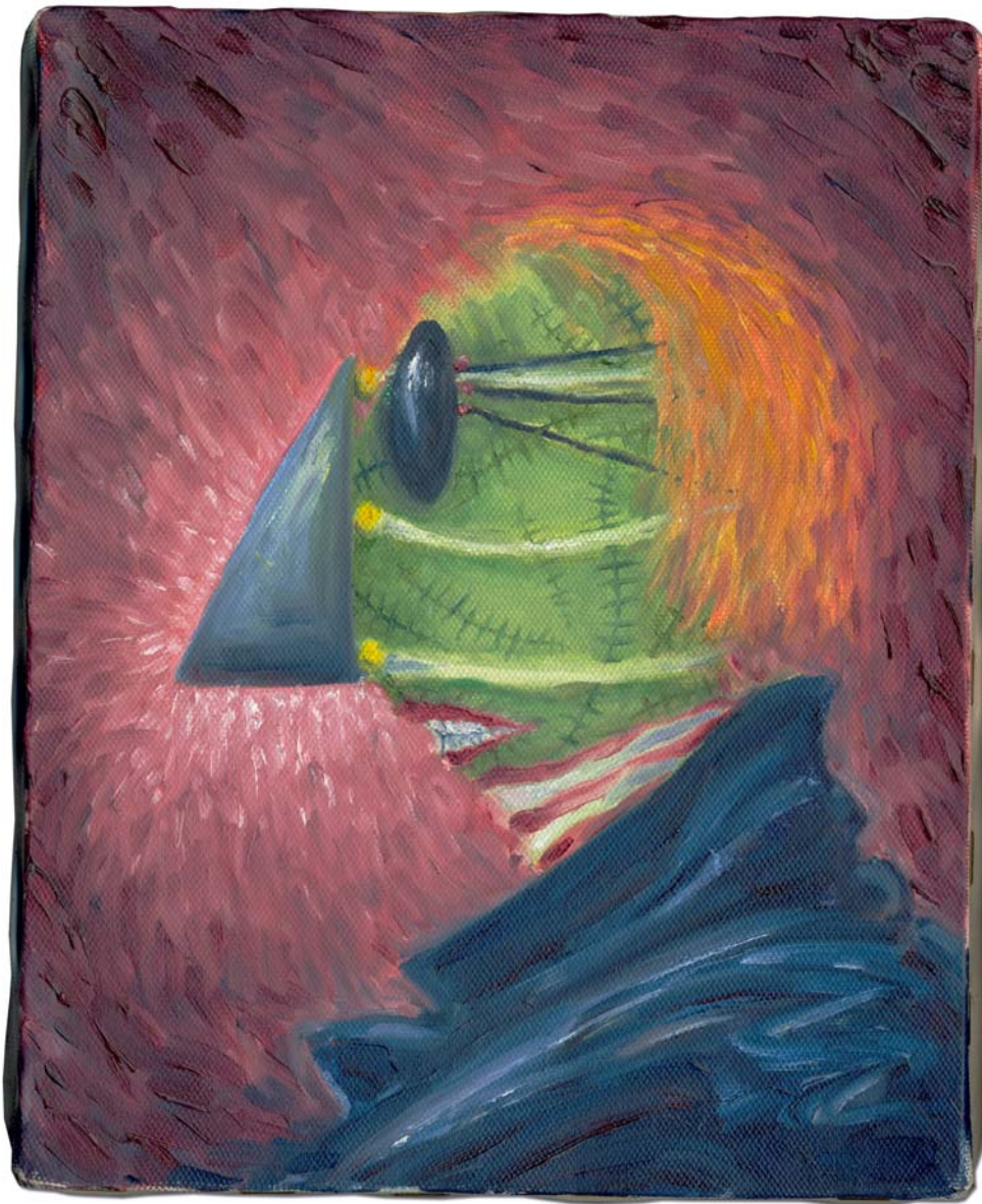
TIM BURTON (American, born 1958) The Green Man, 1996-1998 Oil and acrylic on canvas 25.4 x 20.3 cm Private Collection © 2010 Tim Burton