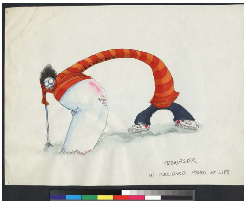
Tim Burton (American, b. 1958) Untitled (Boy Series) 1980-1990 Pen, ink, marker and watercolour on paper 10 x 14" (25.4 x 35.6 cm) Private collection © 2010 Tim Burton

Burton likes to work organically, his ideas are released through his sketches rather than in extensive storyboarding. By working intuitively, Burton has said that he sees recurring themes and images throughout his works. 'It starts with a very good foundation and then kind of goes free.' 12