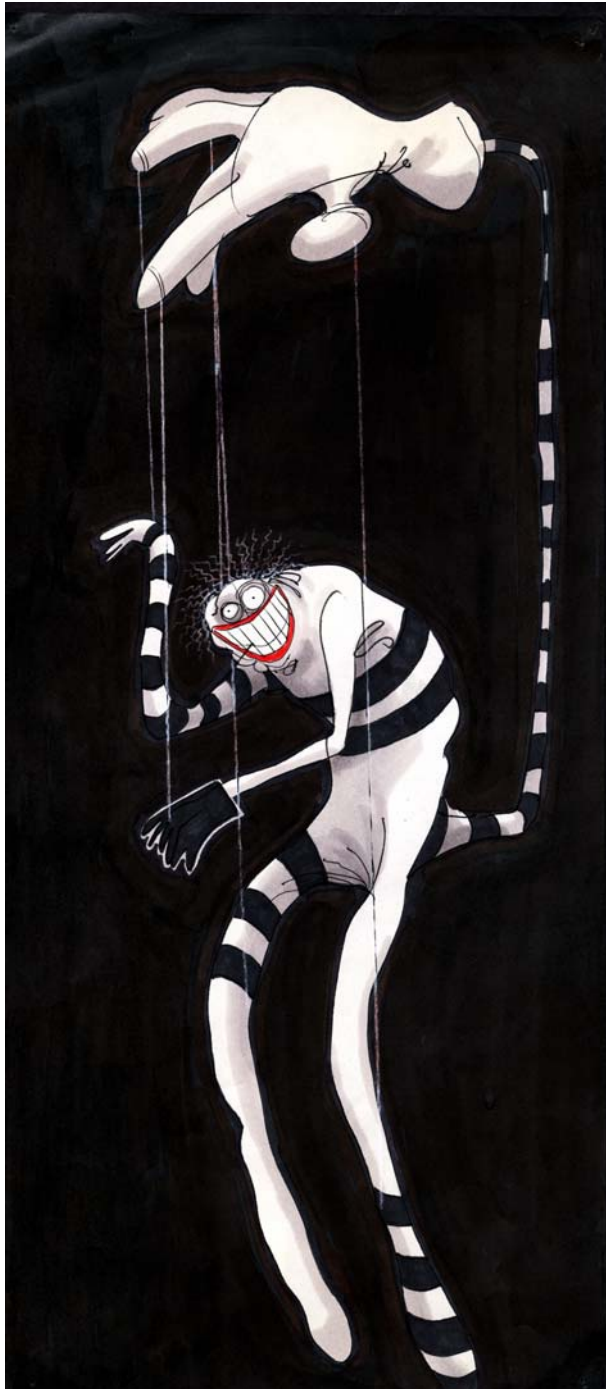
Tim Burton (American, b. 1958) Untitled (Creature Series) 1980–1989. Pen, ink, watercolour wash, and coloured pencil on paper 15 x 6" (38.1 x 15.2 cm) Private collection © 2010 Tim Burton