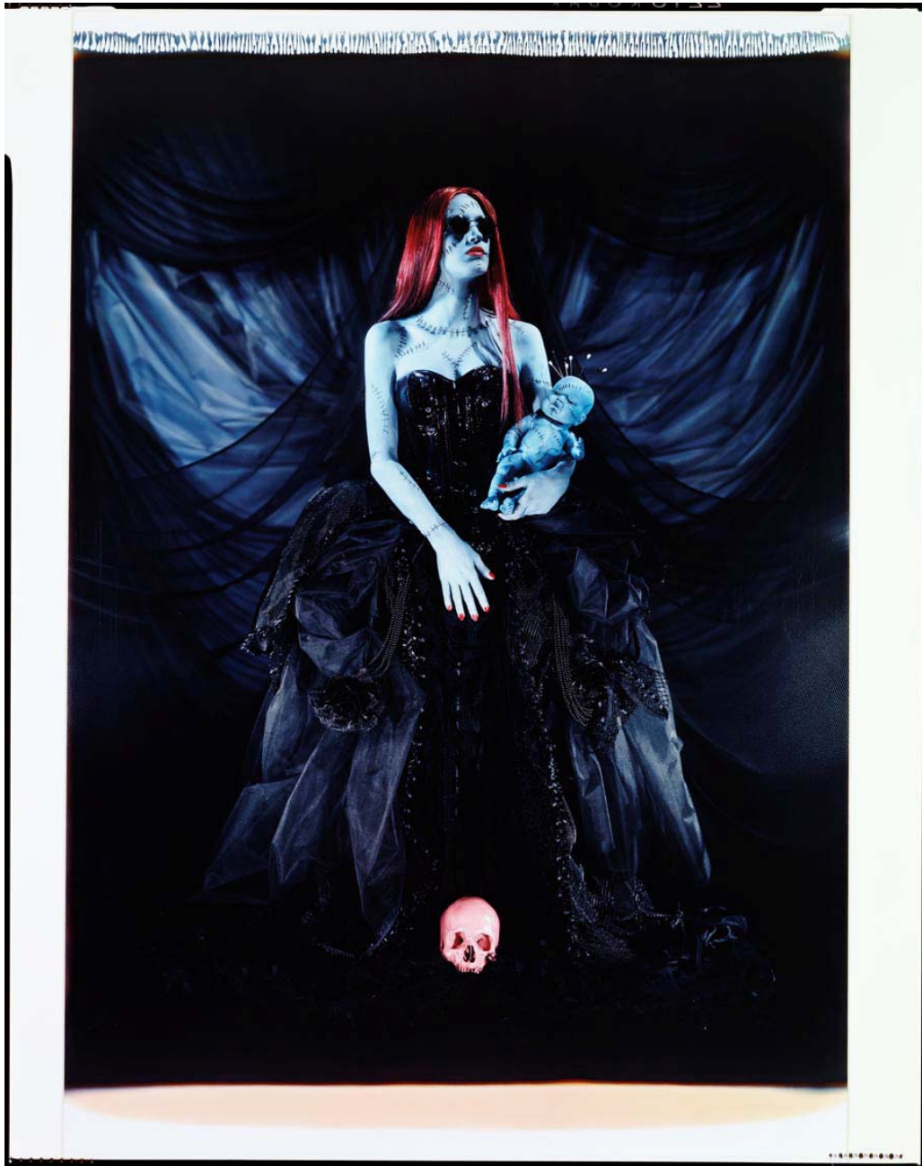
TIM BURTON (American, born 1958) Untitled (Blue Girl with Skull), 1992-1999 Polaroid 83.8 x 55.9 cm Private Collection © 2010 Tim Burton