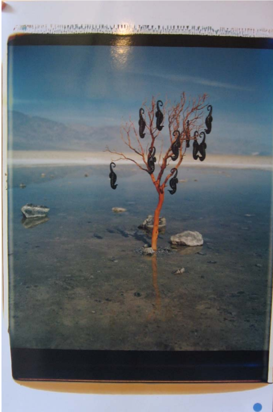
TIM BURTON (American, born 1958) Untitled (Seahorses on Pink Tree), 1992-1999 Polaroid 83.8 x 55.9 cm Private Collection © 2010 Tim Burton