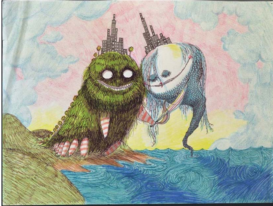
TIM BURTON (American, born 1958) Untitled (Romeo and Juliet), 1981-1984 Pen and ink on paper 30.5 x 40.6 cm Private Collection