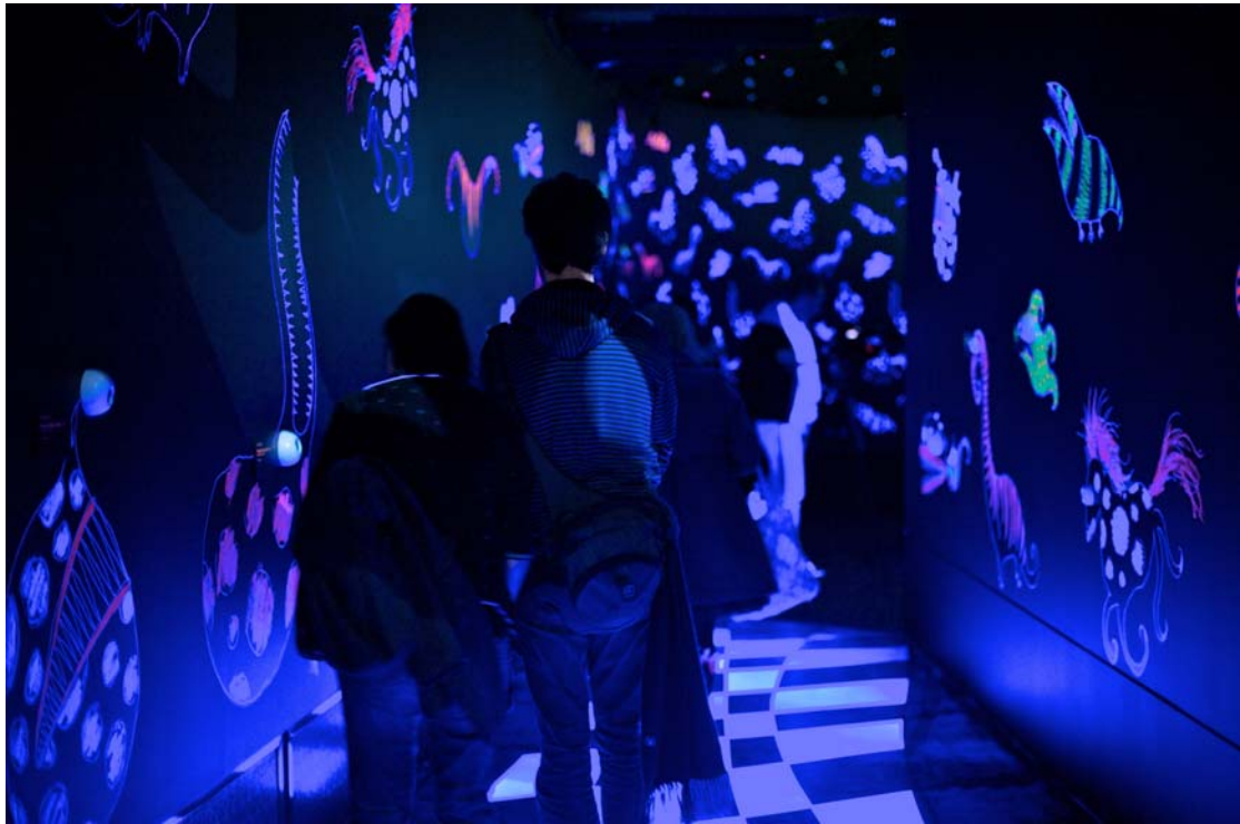
Installation shot of Tim Burton the Exhibition at ACMI, showing the lighting and installation of the black light effect, in the black light room.