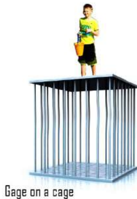
Gage on a cage