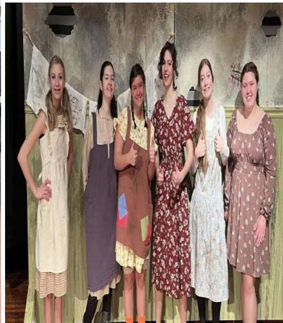
(Photo of Durant High School Band trip to Florida and participating in the “You’re Instrumental Workshop at Disney World) (Photo of Durant High School Drama- Annie Jr. Performance)