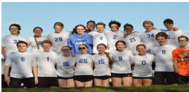
(Picture newly formed “Durant United” Soccer)