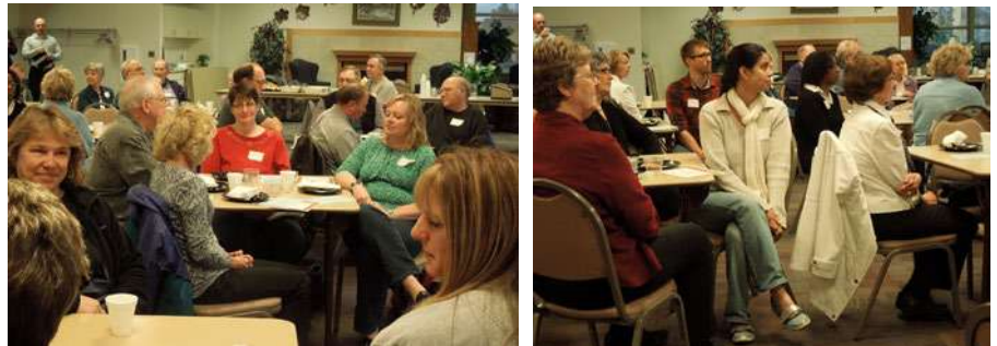
Fridley parents and community members were recognized for volunteering their time to our schools and programs and for their support.

Fridley School District held its annual Volunteer Appreciation Breakfast on May 9, 2014 at the Fridley Community Center. This annual event honors the men and women in our community who support our students and schools through their volunteer work. Volunteers are nominated by each school and are recognized at the Appreciation Breakfast where each principal or director talks about the great work each volunteer does at his/her school or program. This year, the following volunteers were honored: