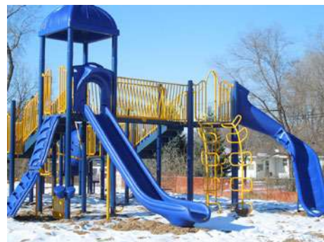
The playground at Hayes a few days after a fire destroyed it on September 20, 2014. Bottom: A new playground has been rebuilt a few feet from the ashes of the old one.