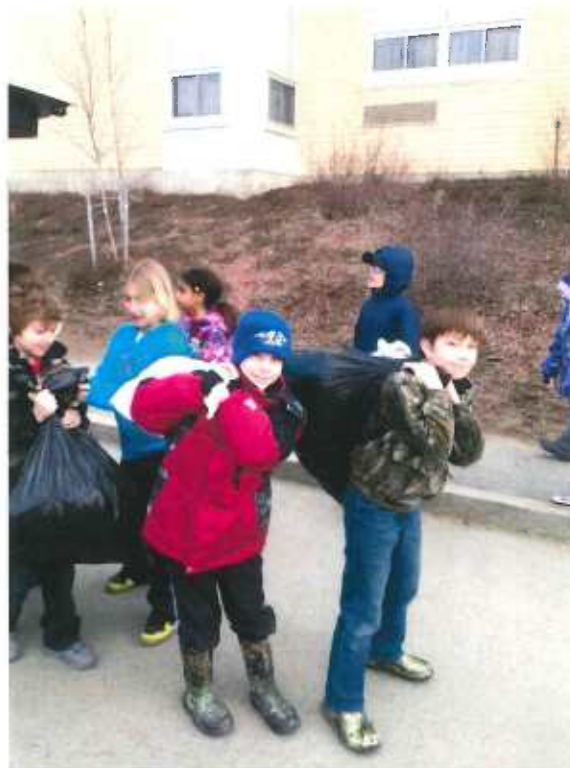
Above are students wearing clothes donated from Westwood and unloading new donations.

Items will be accepted through 3/1. Thank you!