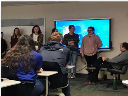
Former CBGS Alumni share their experiences with current CBGS students at the Glens Campus