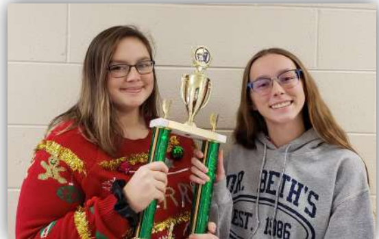
RCC Math Competition Winners