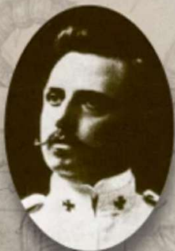
Dr. Aristides Agramonte Autopsies