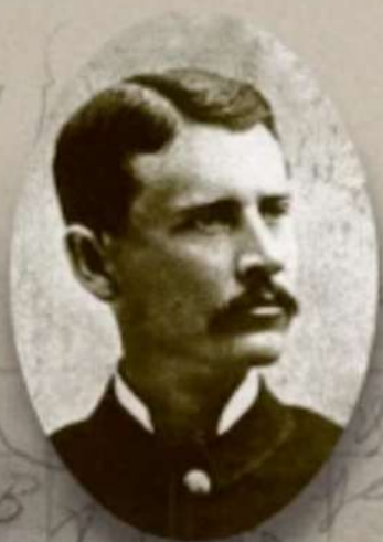
Major Walter Reed, M.D. Director