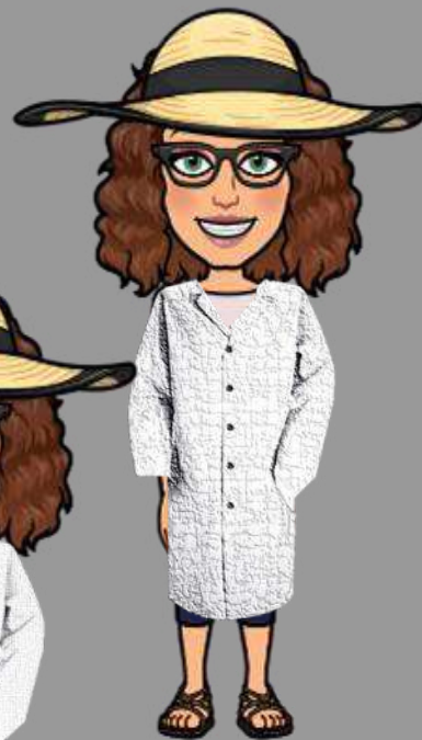
Lab coat and other coats