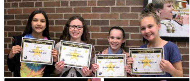
Congratulations Fridley Middle School Academic All-Stars, keep up the great work!