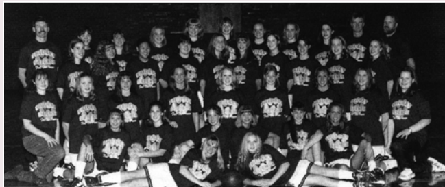
1997 Girls Basketball Team