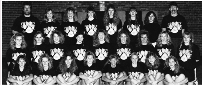
1990 Girls Basketball Team