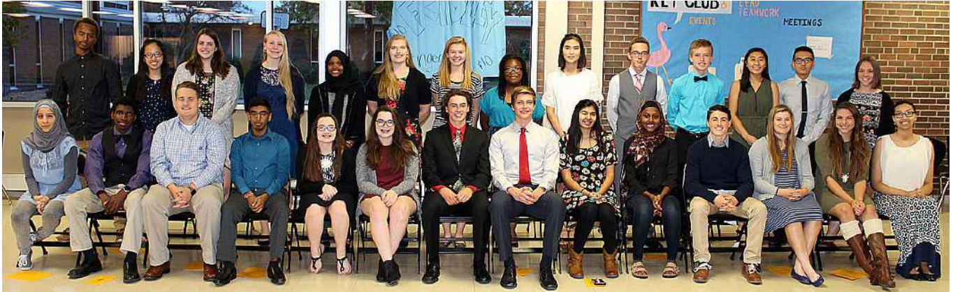
Fridley High School's 2016 National Honor Society inductees are:

Dedicated to the four principles of NHS outlined above, these hard-working students stand out as leaders in their school in honesty and humility.