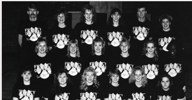
1992 Girls Basketball Team