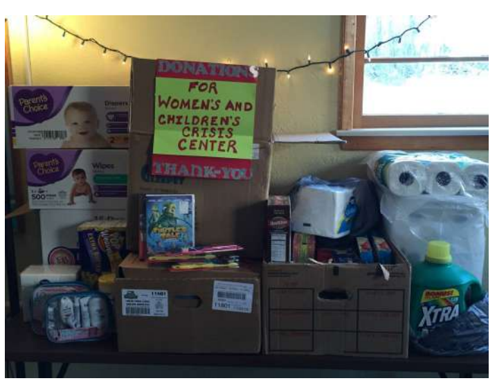
Staff and Students donated items from the Domestic Violence Shelter wish list, as part of our holiday "giving" project.