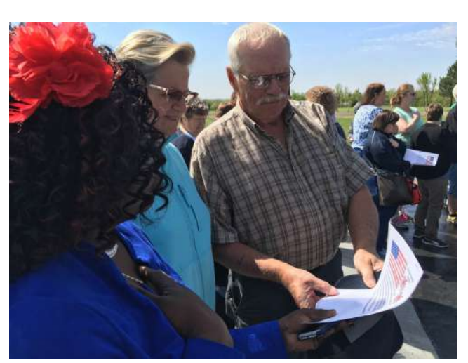
ELL Students & Veterans singing the National Anthem at the Stark County Veteran's Memorial

2. Amendment to Curriculum with a Focus on Social Studies & US Civics. In addition to the Legislative Civics requirement, the staff at the DALC felt it would be beneficial to all students if we were to supplement their education with materials and activities that focus on United States History, important American activists, and other topics such as those regarding individual civic duties. Lessons were created with an awareness of current events and holidays; for example, Black History Month, elections and voting, discussion and explanation of Memorial Day, etc. We felt that by amending our curriculum so as to focus on these areas, we could provide our students with a more well-rounded education and better prepare them for their civic duties.