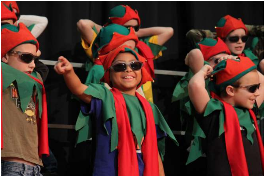
Third graders do their best Elvis impersonations for “Elves Lives.”