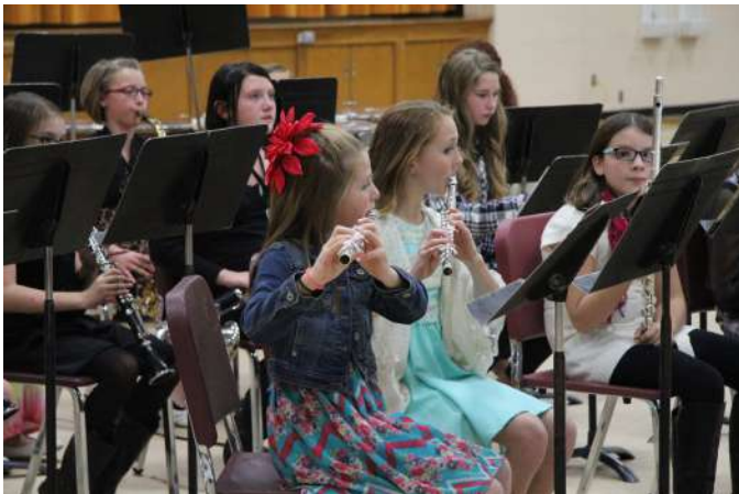
"Good King Wenceslas" was played by the fifth & sixth grade band.