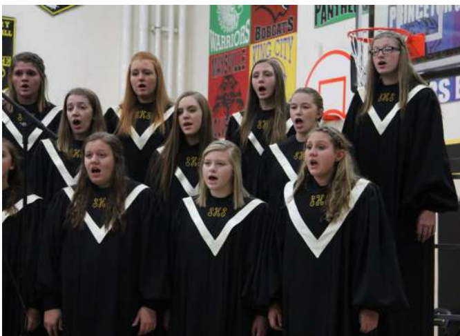
The choir ladies sing "A Festive Noel."