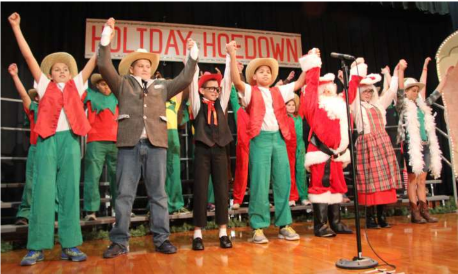
Sixth graders join in the closing number.