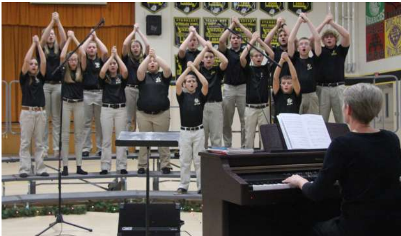
Junior high choir performs "Please Don't Sing Another 'Fa La La'" with the high school choir class members.