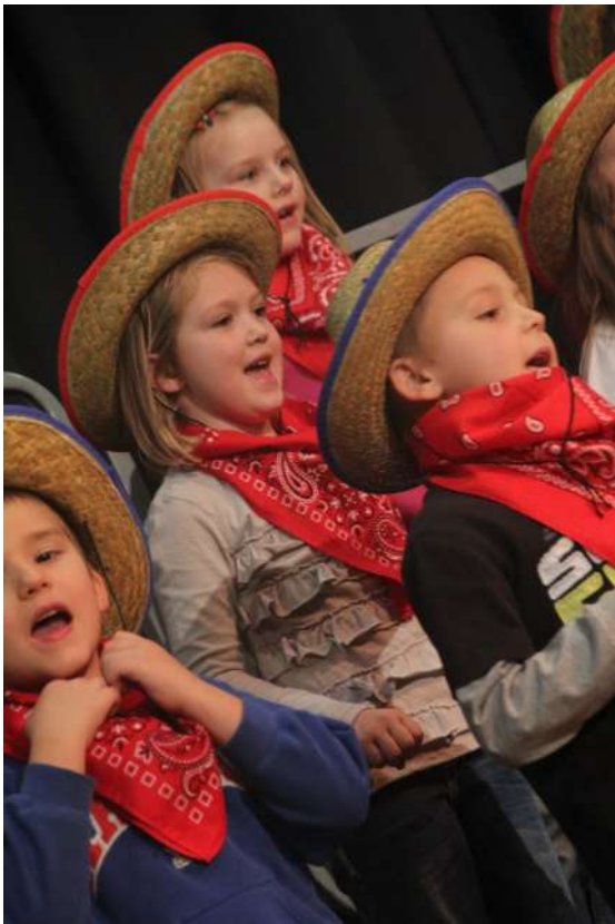
Second graders enjoy their part in the winter concert.