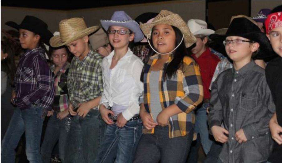
Fourth graders get into the hoedown spirit.