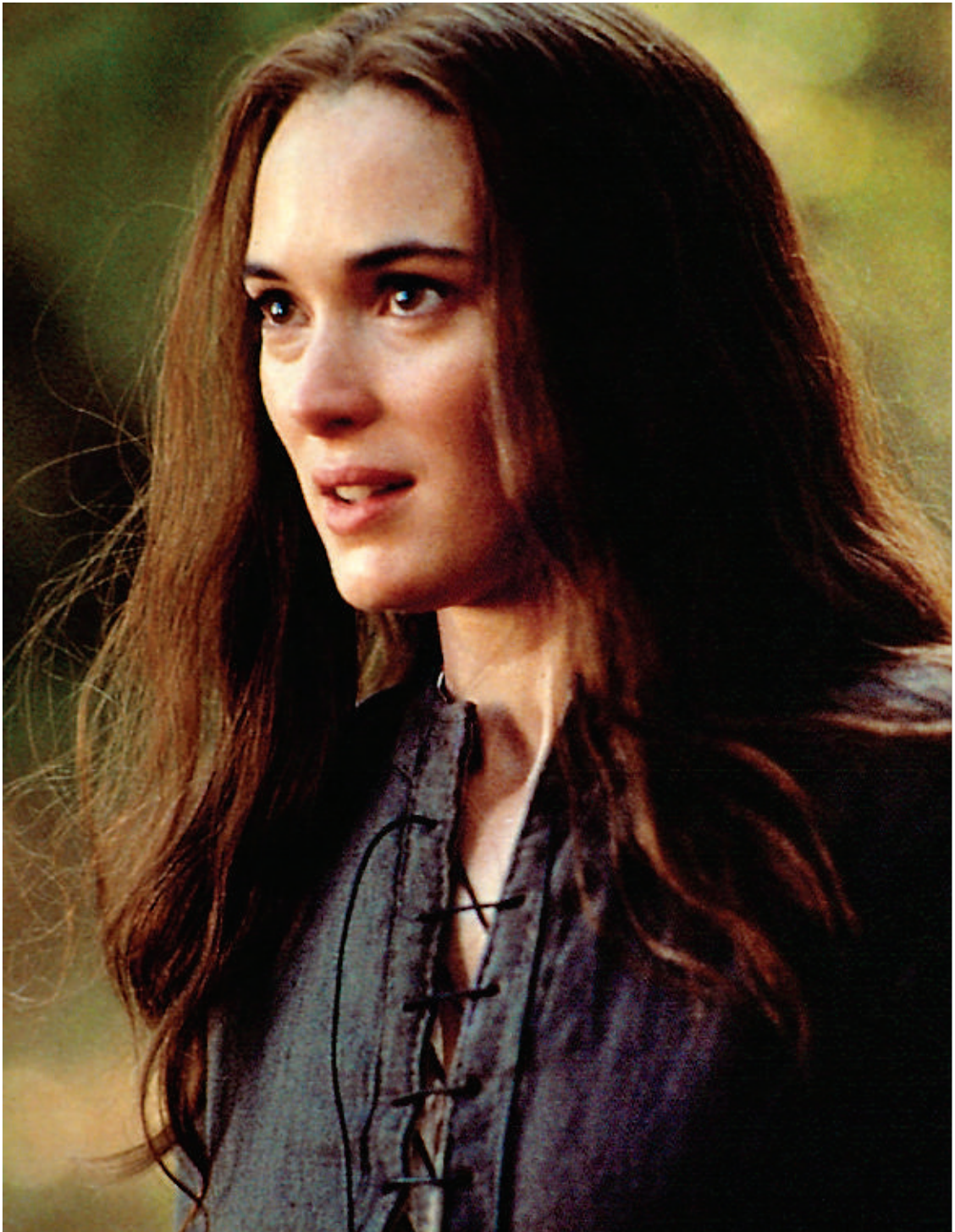
Winona Ryder as Abigail Williams