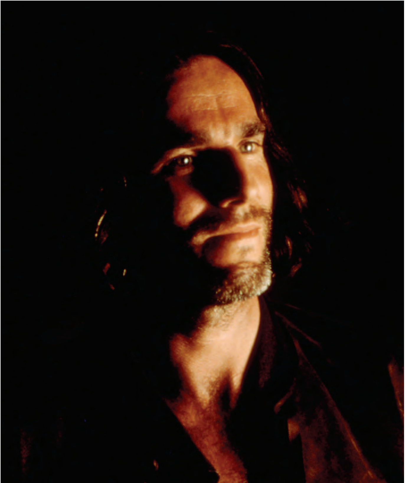
Daniel Day-Lewis as John Proctor