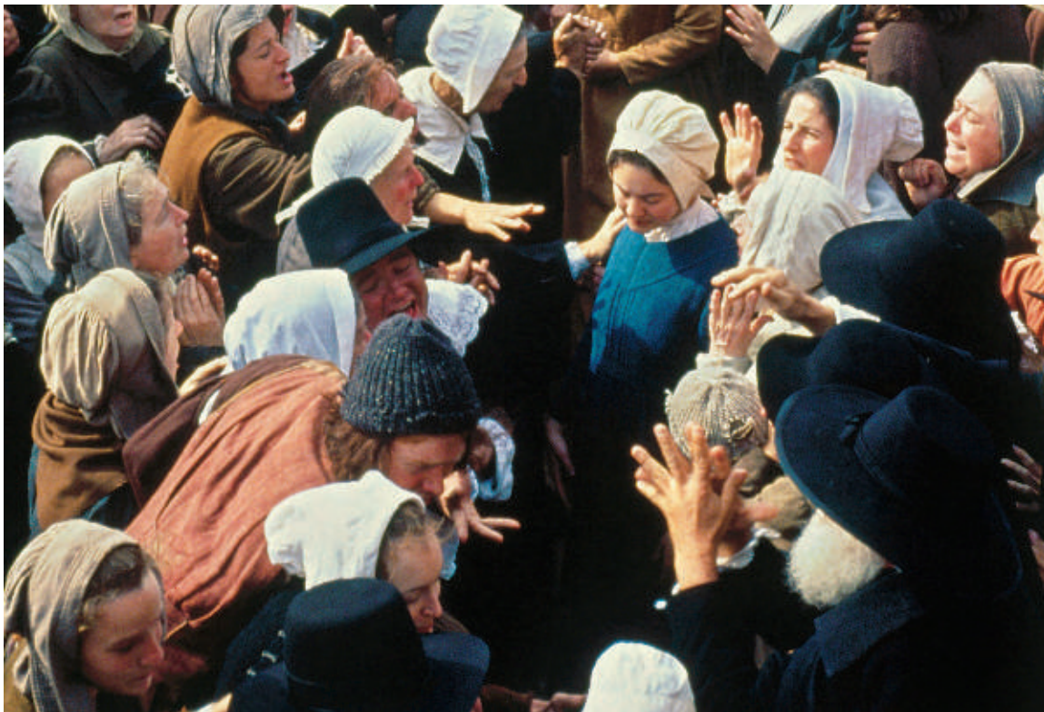
Villagers gathering to gossip

Mary Warren . I never done none of it, Abby. I only looked!