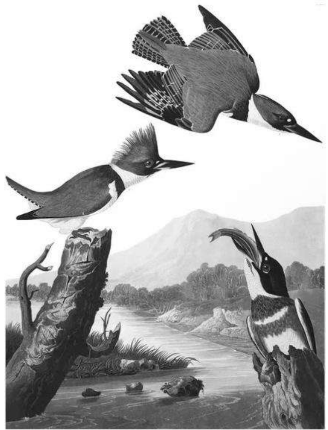
Belted Kingfisher, by John James Audubon