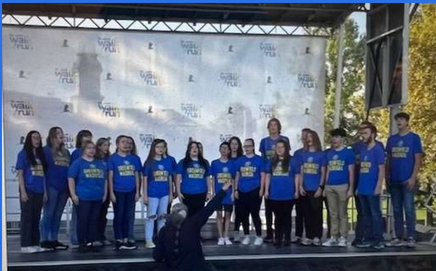
The Madrigal Choir

The choir program is a testament to the diversity at GCSC, beyond football or basketball. The first show night is on December 8th, and the entire program would appreciate a good showing. I am excited to attend and hope to see you there, too!