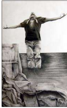
"Divine Adolescence" By Yoni Rodriguez, 2010