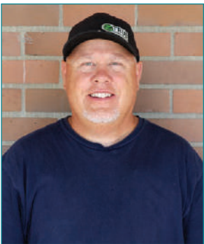
Cameron Rose Grounds Maintenance