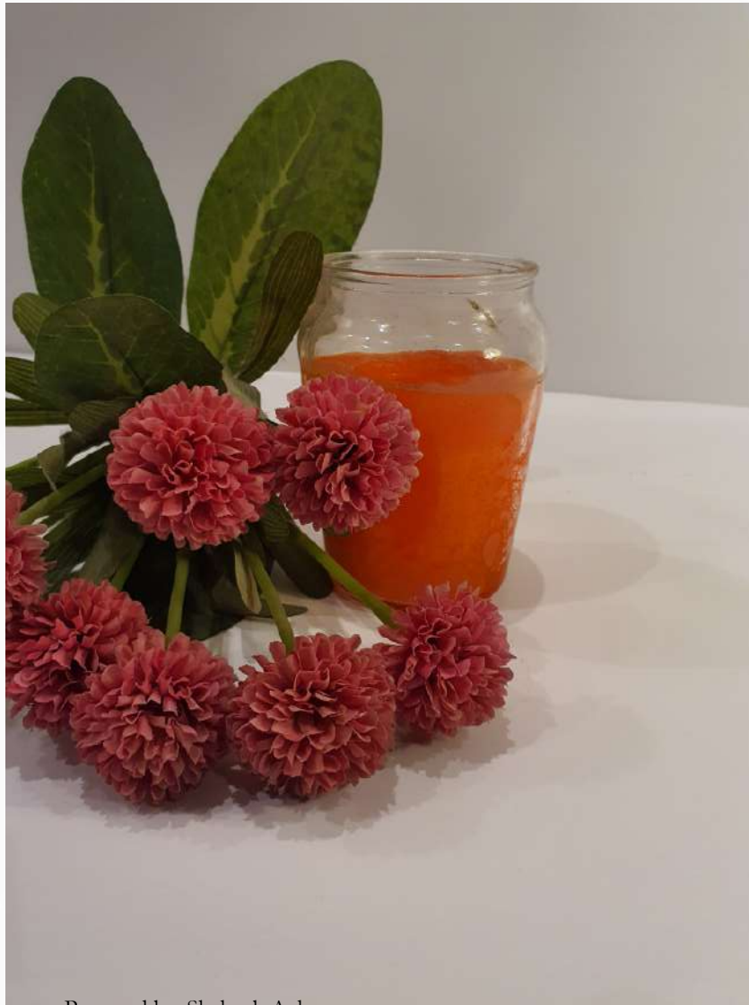
Prepared by: Shahzeb Azhar

This is the image I am starting with. You may choose one of the images I will be sharing or may be of your choice, it can be anything.