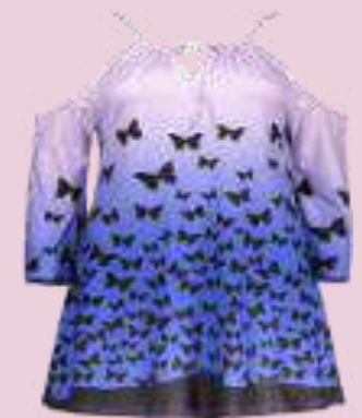
Pants & Tops