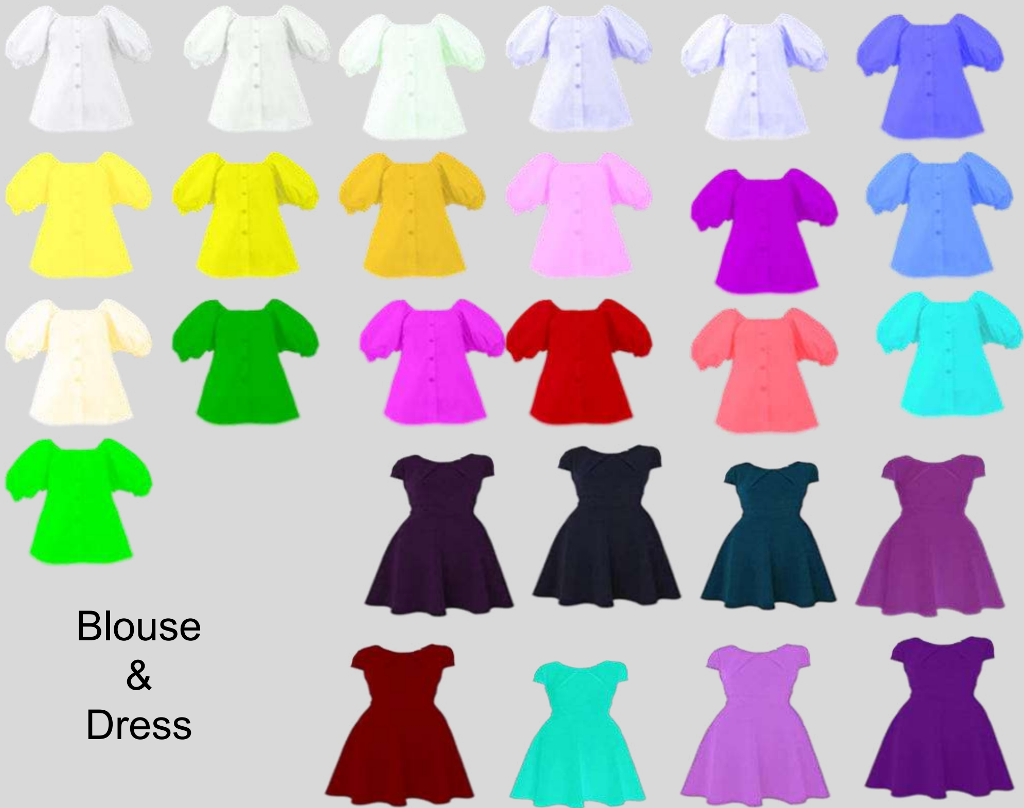
Blouse & Dress