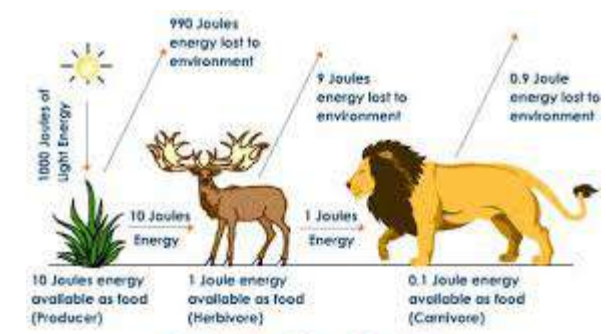
Progressive Loss of Energy in Food Chain