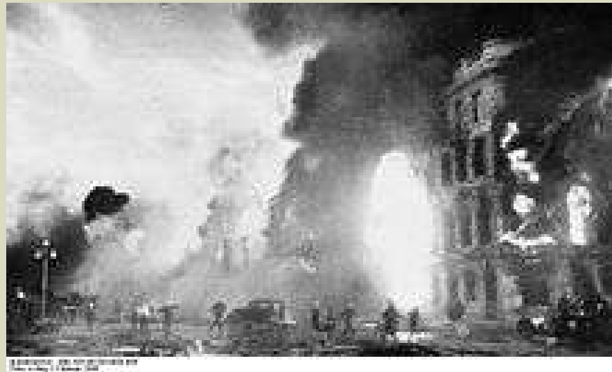
A photograph of the attack on Pearl Harbor, December 7, 1941.