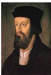
Jan Hus (1369-1415)

his bones were dug up from consecrated ground and burned with his writings