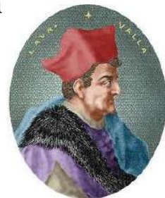
Lorenzo Valla (1407-1457)

convicted as a heretic and burned at the stake