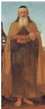
John Wyclif (1328-1384)

English priest, Oxford professor and early critic of the Catholic Church