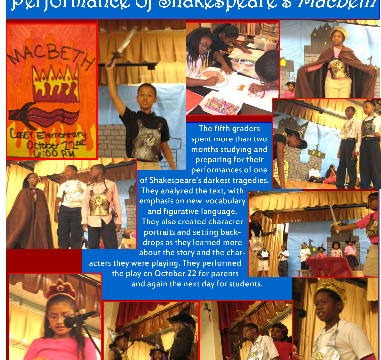
"Will these hands ne'er be clean?"