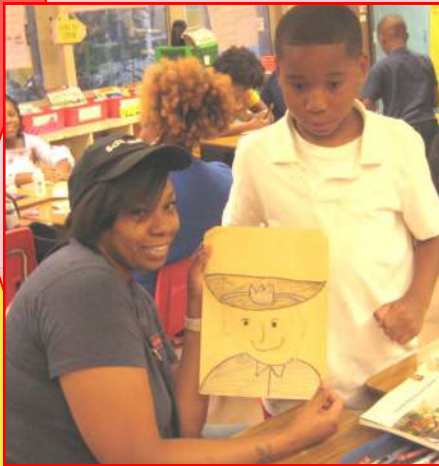
Third graders made portraits of people they admire and filled the pictures with appropriate adjectives.