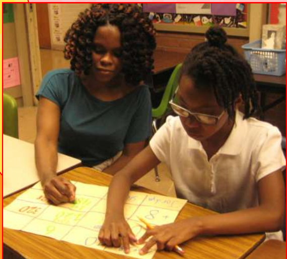
Fourth graders turned two-digit multiplication problems into works of art.