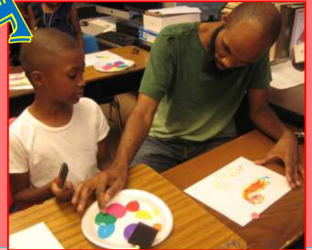
Second graders painted chameleons and their backgrounds.