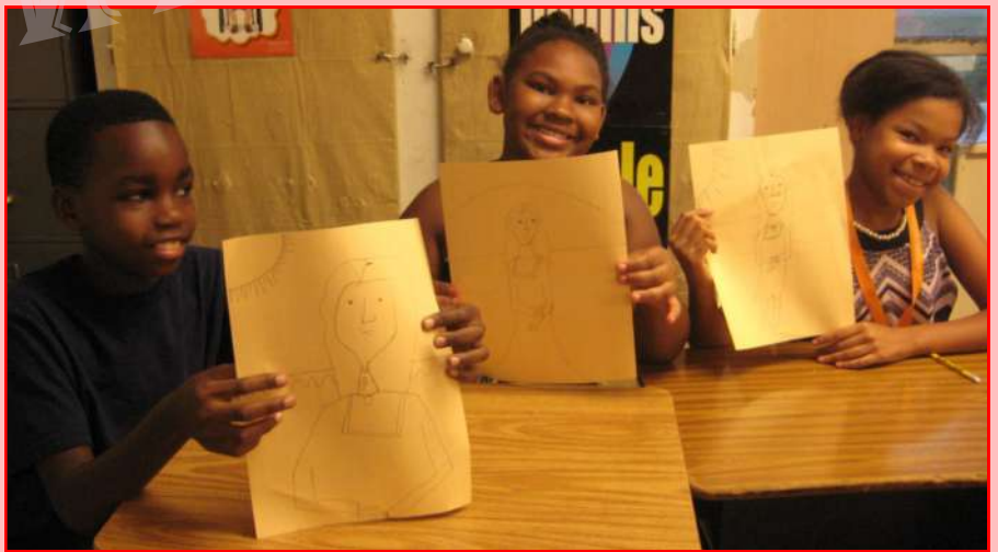
Fifth graders learned to draw Leonardo DaVinci's Mona Lisa .