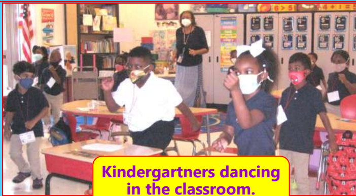
Kindergartners dancing in the classroom.