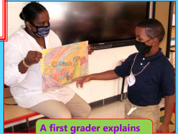
A first grader explains his artwork to the class.