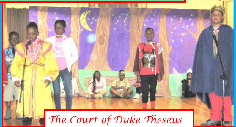
The Court of Duke Theseus