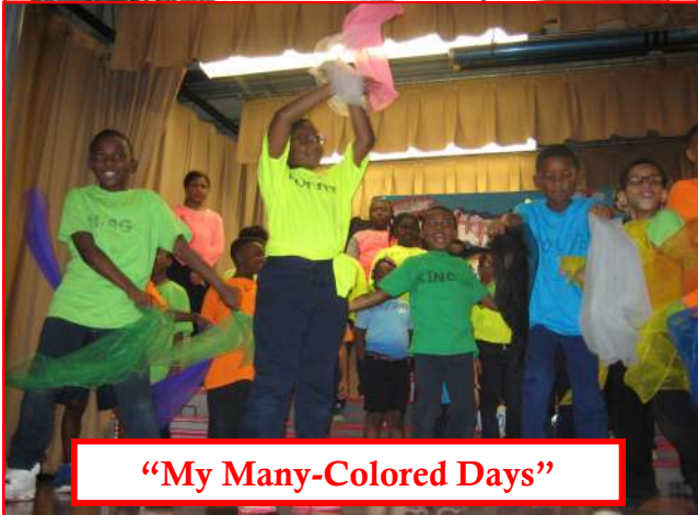
"My Many-Colored Days"

learned over the past several weeks through literature, Tools for Life, inspirational videos, songs, drama, visual art, and dance.