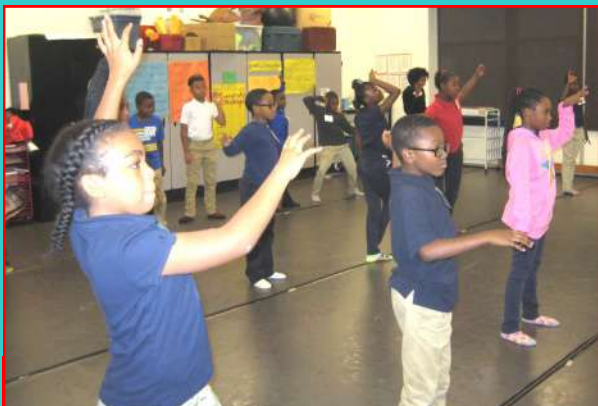
Fourth graders begin their dance classes