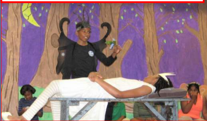
Oberon casts a magic spell on his queen