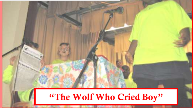
"The Wolf Who Cried Boy"

On November 30, the Casey third graders performed an original, arts-integrated program called Junkyard Wonders , inspired by the books of Patricia Polacco. The program used songs,