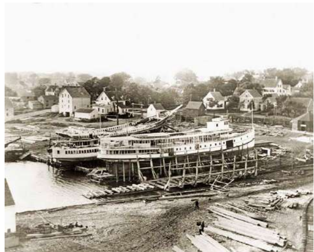
Figure 2. Searsport, Maine Shipyard circa 1913