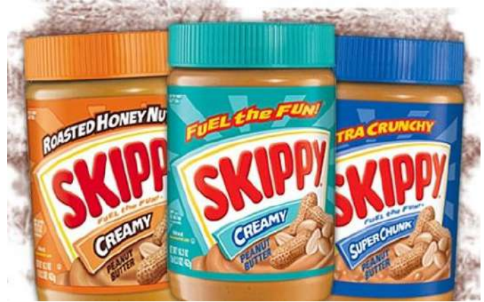
Example 2: Skippy to Super Crunchy, etc.