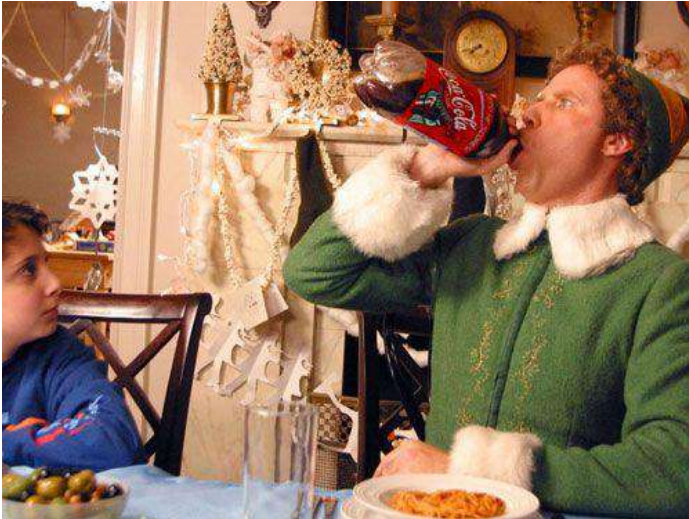
Example1 : Elf drinking Coca Cola

Product placement is an advertising practice where businesses gain exposure for their products by paying for them to be featured in movies and television programs.