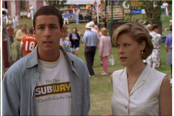
Example 2: Happy Gilmore wearing Subway shirt

Your Name: Movie/Show(s) you watched: Examples of Product Placement: