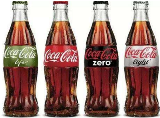
Example 1: Coca Cola extends to Zero, Light, etc.

Product line extension is a new product that is slightly different to a company's original/ popular item (like Coca Cola adding Diet Coke, Coke Zero, etc.)