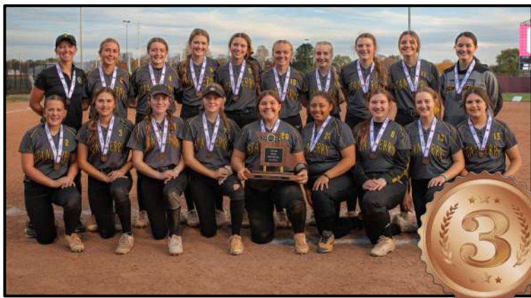
The softball team defeated the Paris Lady Coyotes to win 3rd Place at State! They are the first team in Stanberry softball history to make it to state competition.