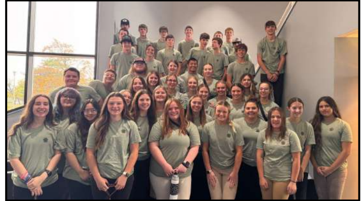
High school FCCLA members attend their annual regional meeting on the campus of NWMSU.

After all of the workshops had been completed it was time for awards to be handed out. A raffle was also held after the awards.