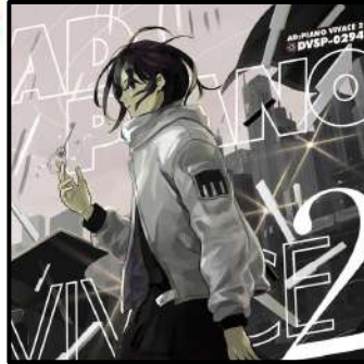
Artist: Diverse System Album: AD:PIANO VIVACE 2 Release: 2023

Untheory from Avans lives up to its name alright. It has, by far, the weirdest idea behind it. But hey, the execution is good. This is more of an abstract piece. This feels like more of