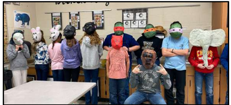
Seventh grade art students display their mask creations.