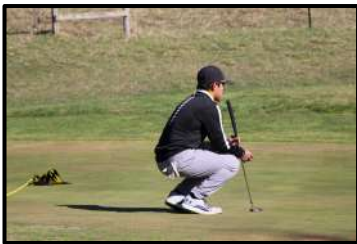
Jordyn checks the slope of the green before putting.