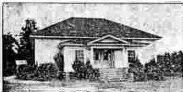
Original Brushy Creek Elementary School 1916

Brushy Creek Elementary School has a long history of excellence in education, care and concern for students, and a strong involvement with the community. The first Brushy Creek School building was built in 1916. It was a four-room structure and stood across Brushy Creek Road from the present day building. Early on, quiet fields and busy farms surrounded the school. Across the street was Brushy Creek Baptist Church; distinguished for being the oldest church in Greenville County. Up the road was the prosperous and progressive Silverleaf Dairy.