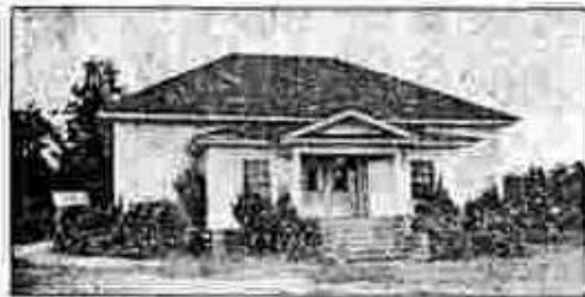
Original Brushy Creek Elementary School 1916

Brushy Creek Elementary School has a long history of excellence in education, care and concern for students, and a strong involvement with the community. The first Brushy Creek School building was built in 1916. It was a four-room structure and stood across Brushy Creek Road from the present day building. Early on, quiet fields and busy farms surrounded the school. Across the street was Brushy Creek Baptist Church; distinguished for being the oldest church in Greenville County. Up the road was the prosperous and progressive Silverleaf Dairy.