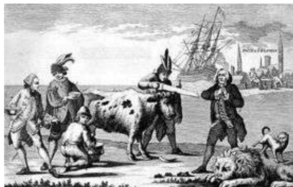
Cow representing English commerce being milked and dehorned by France, Spain, Holland, and the United States while the British lion sleeps, during the American Revolutionary War.