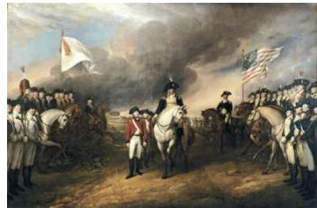
Surrender of Lord Cornwallis by John Trumbull, depicting the British surrendering to French (left) and American (right) troops. Oil on canvas, 1820.

greatly strengthened the British military