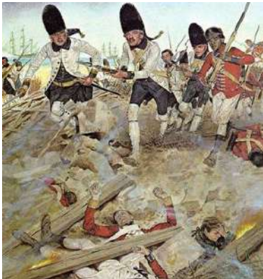
Spanish forces overrun the British lines during the Battle of Pensacola (1781).

Spain also disliked Britain and were closer to the French