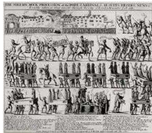
"A Solemn Mock Procession of the Pope" held in London in 1680. The Whigs burned effigies of the Pope, cardinals, friars, and nuns.

Parliamentarians who supported James as king and the hereditary monarchy in general