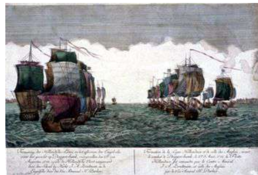
The dutch formation in the battle of Dogger Bank, 5th august 1781.

when Britain discovered this secret trade agreement they declared war on the Dutch