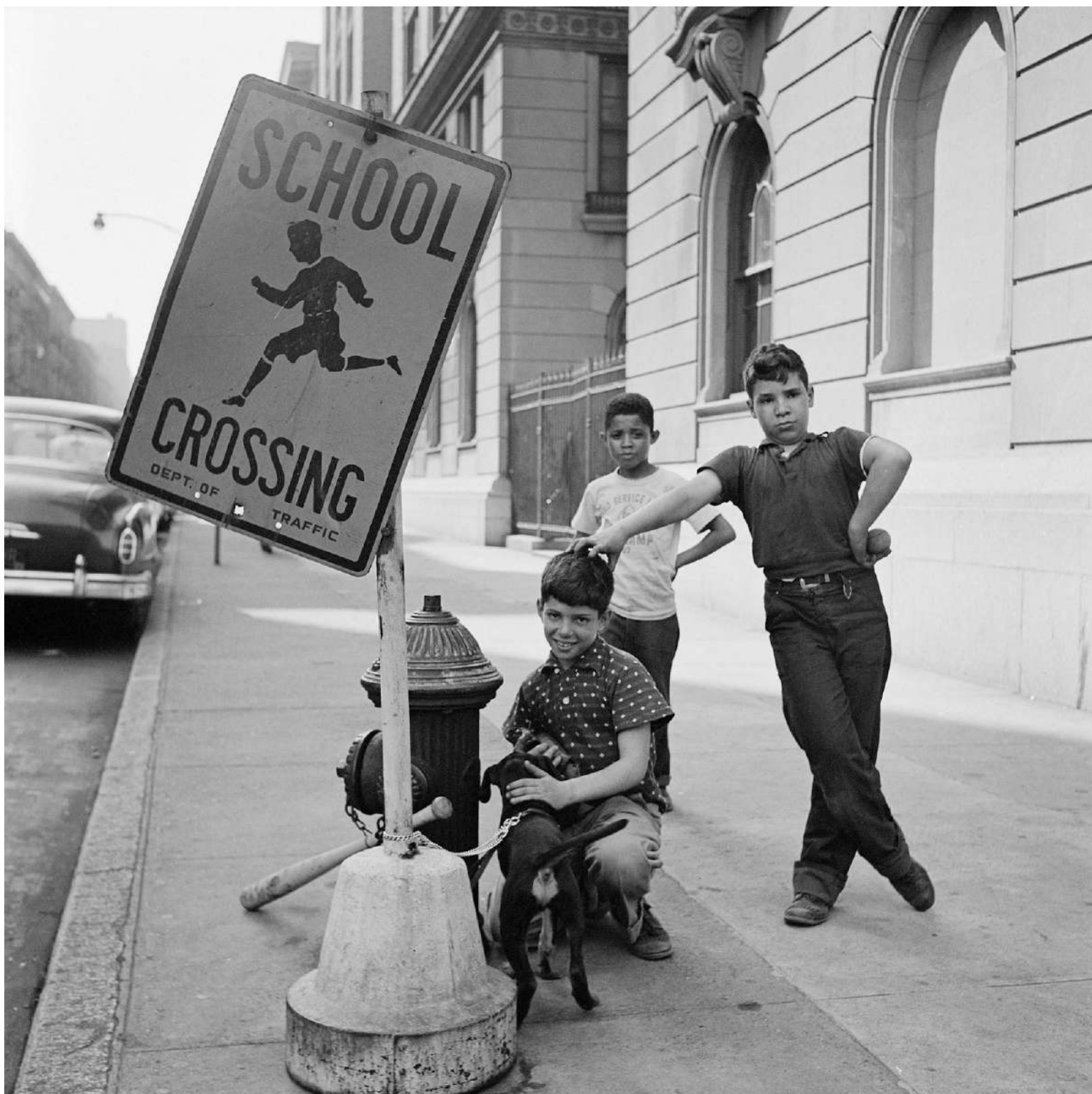
Vivian Maier New York, NY, June 1954 Gelatin silver print; printed later 12 x 12 inches